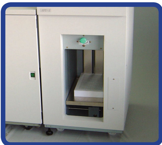
BM500 ASU (Auto Stacker Unit)